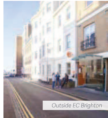
Outside EC Brighton