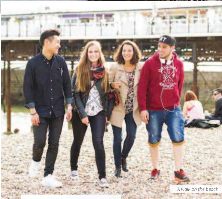
A walk on the beach