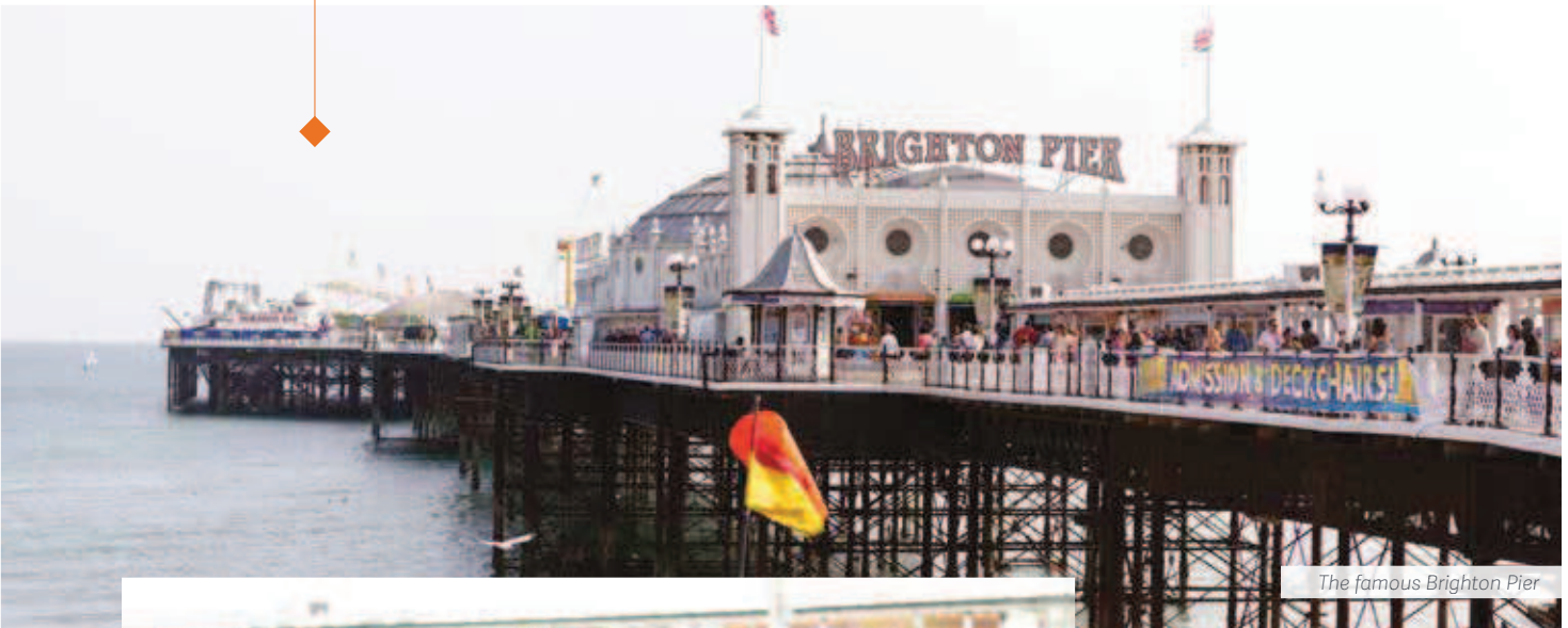
The famous Brighton Pier