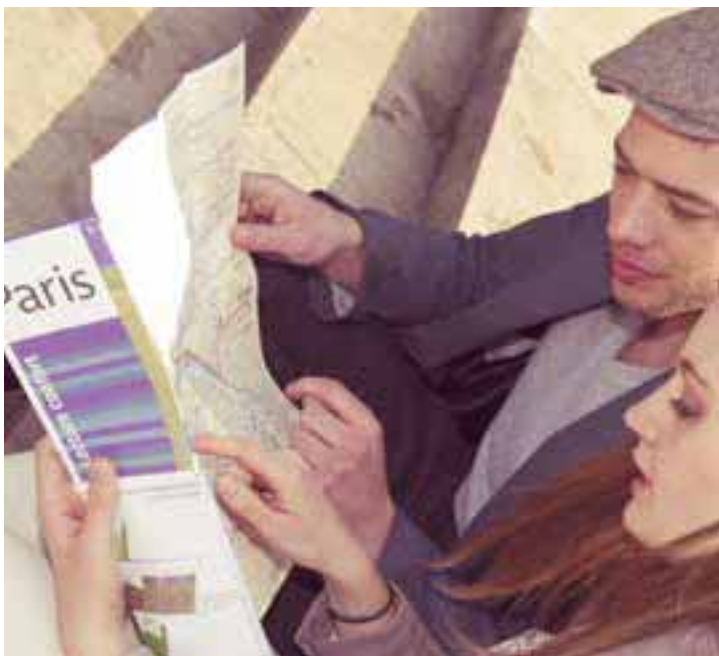
Essential to any trip to Paris is a tour of its many historic and cultural sights. But don't neglect the Savoir Vivre – the art of life.