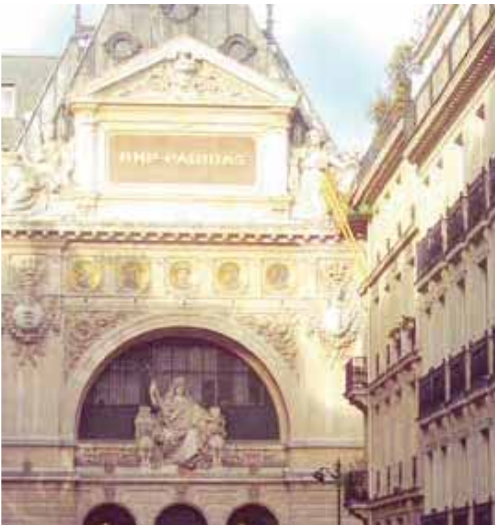
Students will find themselves amidst the historical, cultural, artistic and economic centre of Paris with the school within walking distance of countless museums and restaurants.

A must-see for everybody! Find out, why this beautiful metropolis enchants almost everyone – sooner or later.