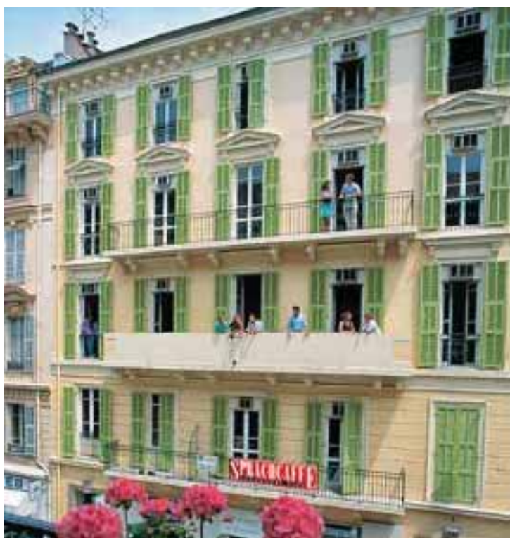
Sprachcaffe Languages PLUS Nice, situated just a stone's throw away from the Cathedral of Nôtre Dame, is located in a stunning building which dates back to the Belle Époque.

Find the perfect balance between a modern business city, magnificent views and French 'savoir vivre'.