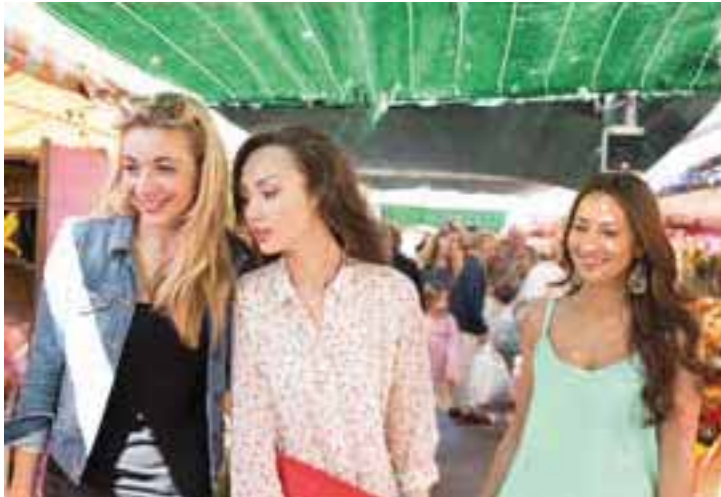
The famous flower market perfectly embodies the vibrancy of life in Nice: a visit is compulsory! Don't miss this opportunity to strike up a conversation with some friendly locals.