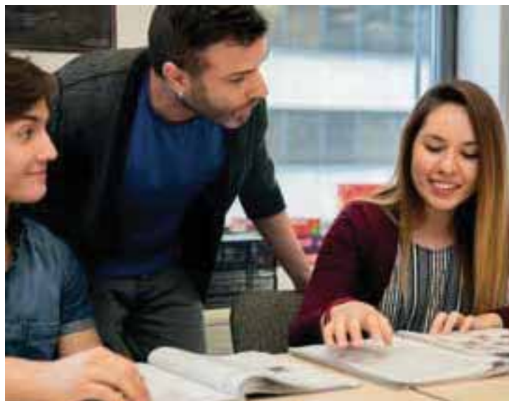
Located in the very heart of undoubtedly the most romantic city on Earth, Sprachcaffe Paris was founded in 1986 as a private institute.