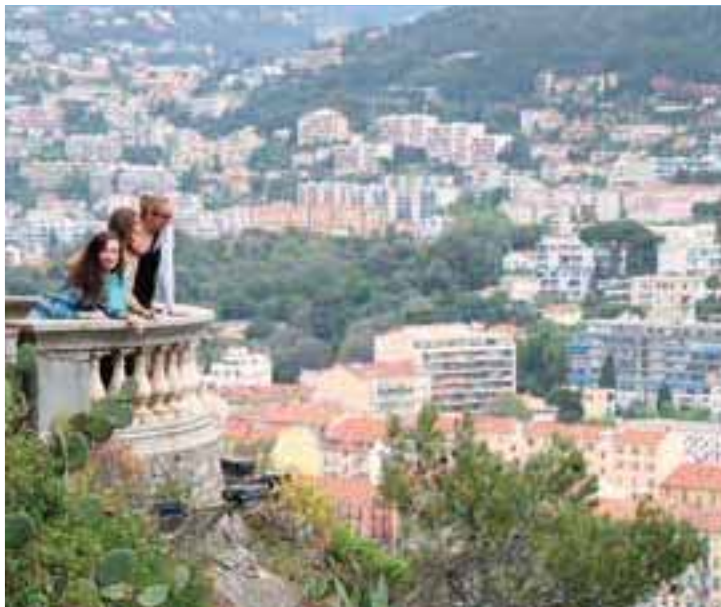
Public transport options are a short walk away and the beach is just twenty minutes away from school by foot, meaning that students enjoy a perfect getaway after class.