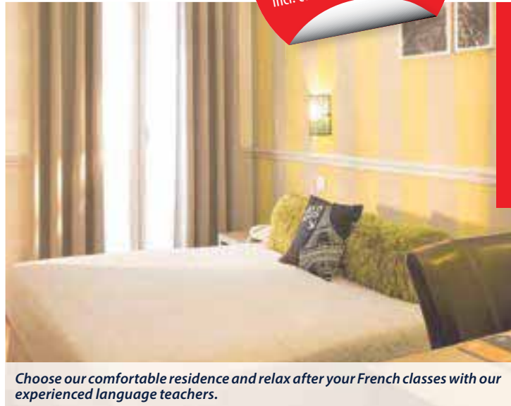
Choose our comfortable residence and relax after your French classes with our experienced language teachers.