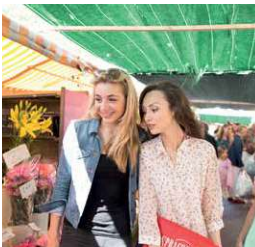
The famous flower market perfectly embodies the vibrancy of life in Nice: a visit is compulsory!