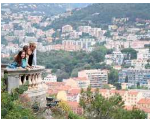
Enhance your language skills while exploring the enchanting streets, savouring local cuisine, and embracing the vibrant culture of the city.