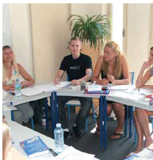
Embark on a transformative linguistic journey with our expertly crafted lessons.