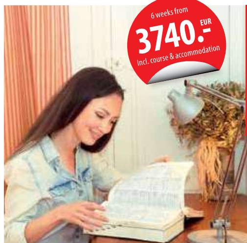
Discover a world of academic excellence and cultural enrichment as you engage in immersive studies.

6 weeks from 3740.- EUR Incl. course & accommodation